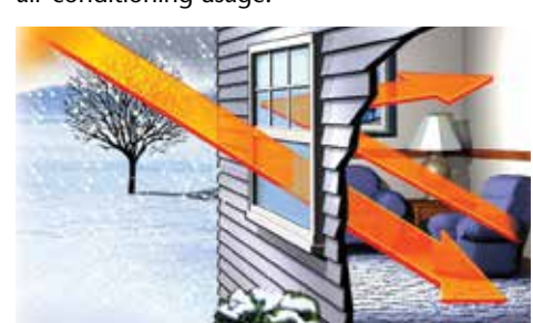
Winter Energy Savings: Low-E insulating glass reduces heat loss by reflecting warm air back into your home.