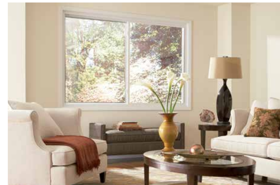
Above Top: Fusion Double-Hung Windows feature a constant force balance system to ensure smooth operation; both sashes tilt in for convenient cleaning from inside your home. Above: Fusion Sliding Windows glide horizontally on a nylon-encased dual brass roller system, and the sashes lift out for easy cleaning.